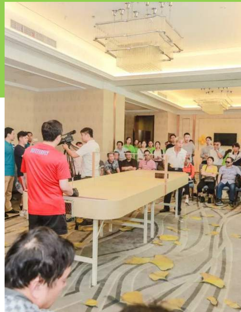
盲人板铃球 教学活动