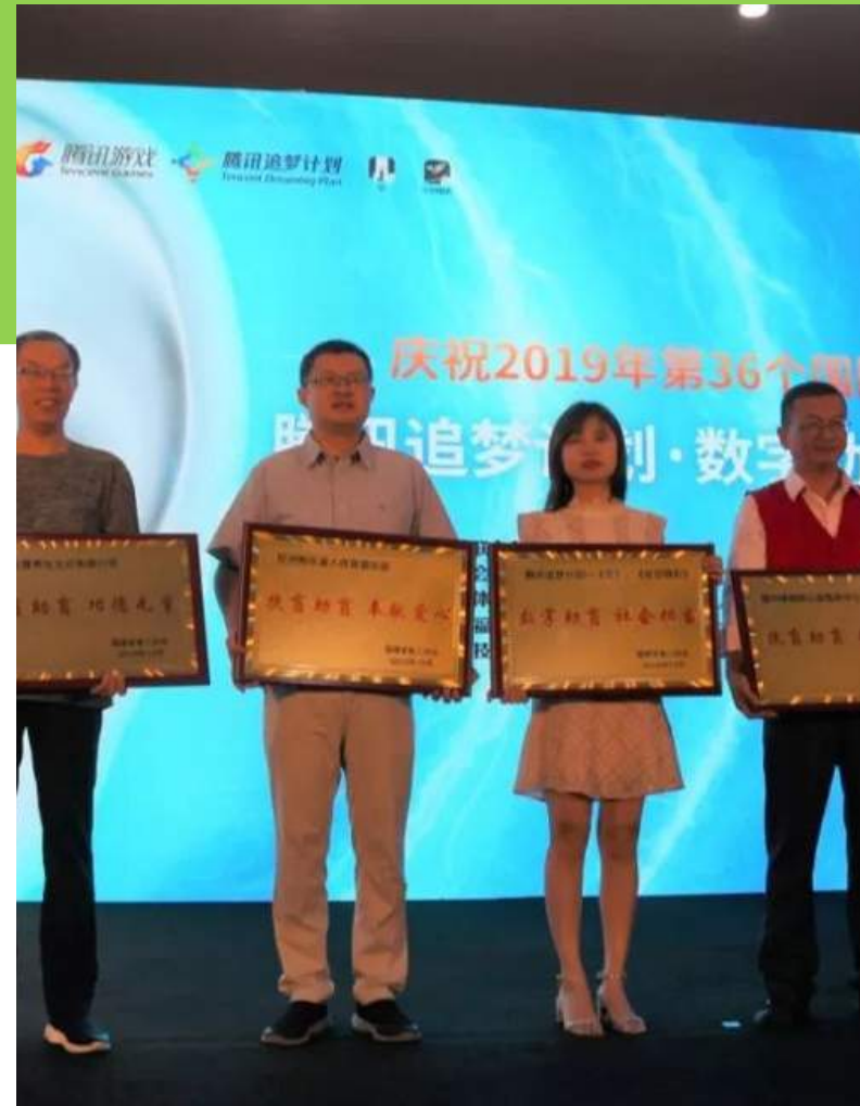
The Donation Ceremony of Showdown Equipments