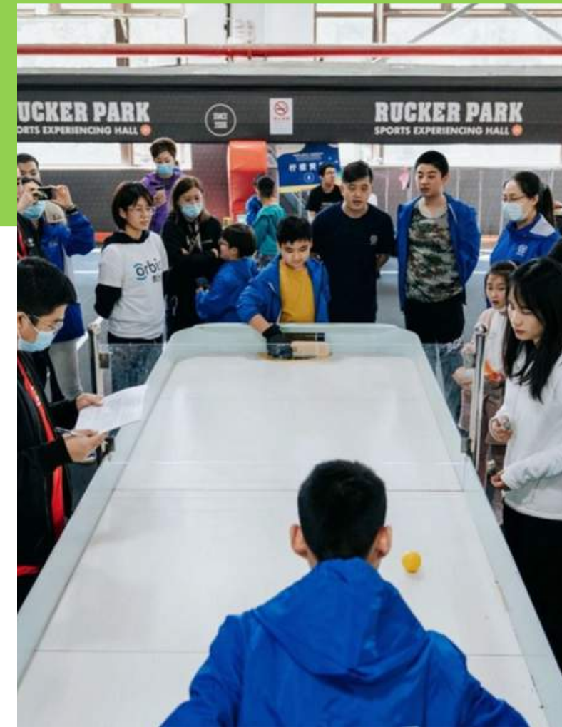
Showdown for All Employees with Blind!